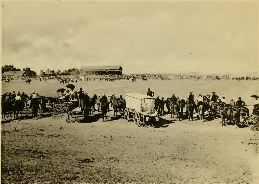
WATCHING THE SHOW.